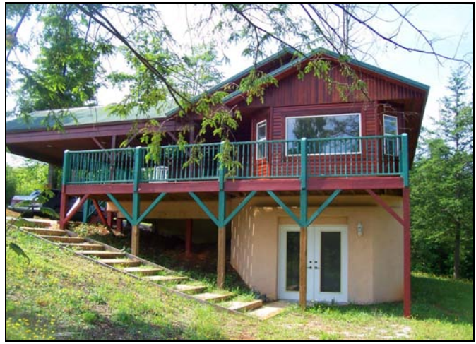
The Reunion Headquarters