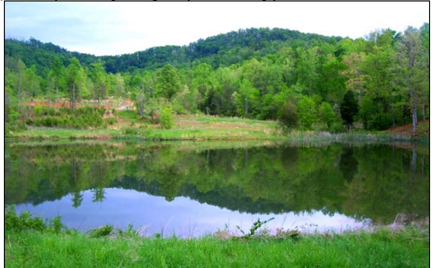
Otter Lake down the road...