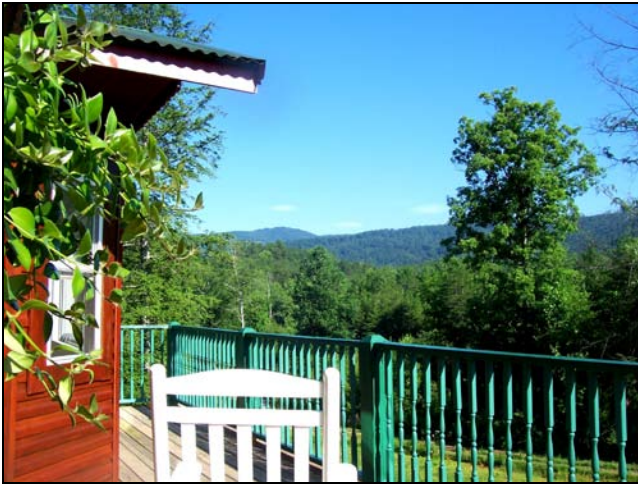
The View From the Deck...