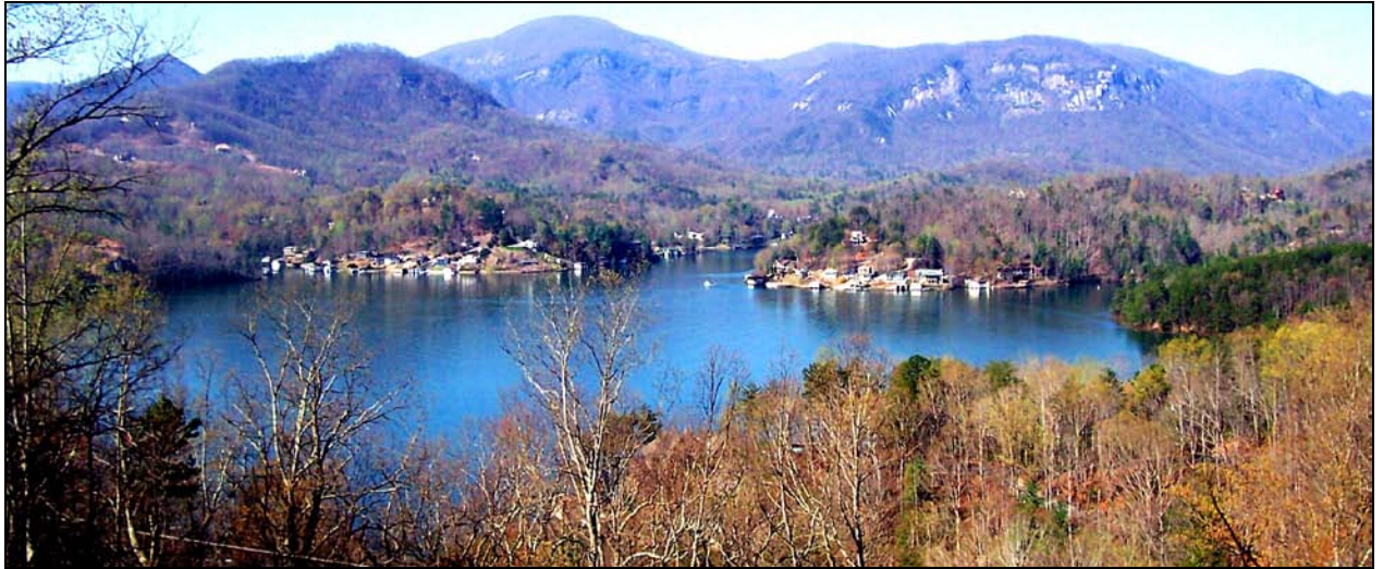
Lake Lure and Chimney Rock